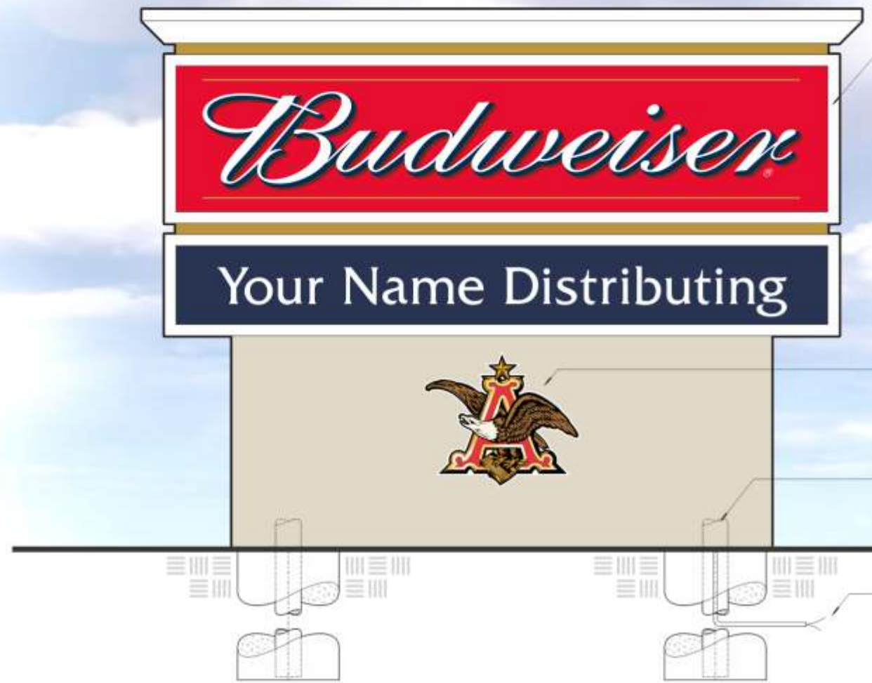
FRONT ELEVATION - TYPICAL D/F SIGN

INTERNALLY ILLUMINATED ID. & DISTRIBUTOR NAME CABINETS W/ TRANSLUCENT ACRYLIC FACES INTERNALLY ILLUMINATED BY WHITE LED. CABINETS FEATURES ALL ALUMINUM CONSTRUCTION W/ EXTERIOR SURFACES PAINTED CUSTOM ACRYLIC POLYURETHANE FOR LONG-TERM OUTDOOR LIFE. SIGN IS BUILT TO MEET UL SPECIFICATIONS AND INTENDED TO BE INSTALLED IN ACCORDANCE W/ THE REQUIREMENTS OF THE NATIONAL ELECTRICAL CODE.