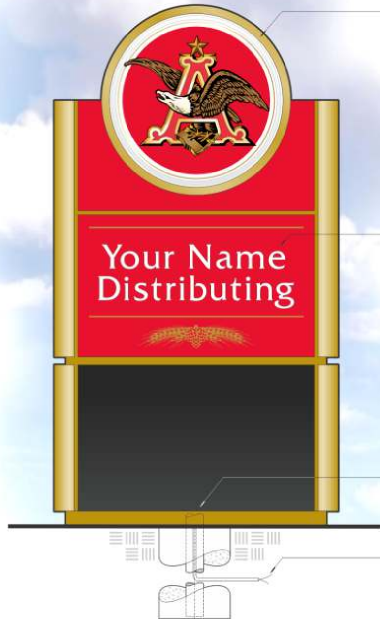
FRONT ELEVATION - TYPICAL D/F SIGN

INTERNALLY ILLUMINATED ID. CABINET W/ TRANSLUCENT ACRYLIC FACES INTERNALLY ILLUMINATED BY WHITE LED. CABINET FEATURES ALL ALUMINUM CONSTRUCTION W/ EXTERIOR SURFACES PAINTED CUSTOM ACRYLIC POLY-URETHANE FOR LONG-TERM OUTDOOR LIFE. SIGN IS BUILT TO MEET UL SPECIFICATIONS & INTENDED TO BE INSTALLED IN ACCORDANCE W/ THE REQUIREMENTS OF THE NATIONAL ELECTRICAL CODE.